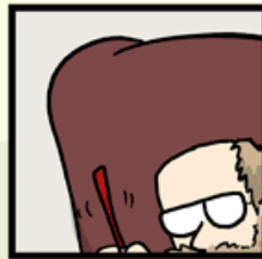
FINAL_rev.22.comments49. corrections.10.#@$%WHYDID ICOMETOGRADSCHOOL????.doc